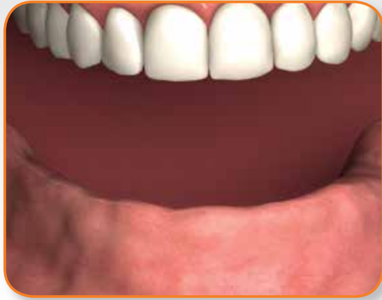
typical patient with missing teeth